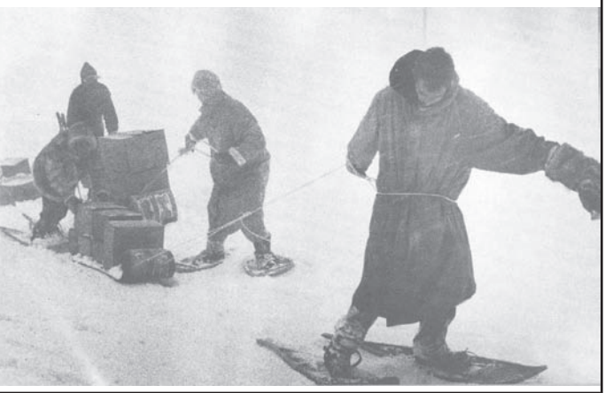
April, 2010 issue 20 page 5

Sugar Bowl today [1948]...a European-style winter paradise...A Southern Pacific train left San Francisco at 9:00 P.M. and arrived at Norden at 7 in the morning, every day of the week. Sugar Bowl also boasted the first chairlift in California, awesome giant wooden towers that ran 3,000 feet from the peak of Mt. Disney down to the front window of the three-story Tyrolean lodge building....Imagine all this for the nostalgically low price of only $10 per day for a private room with bath, $1.25 for dinner in the rustic wood-paneled dining room, and 25 cents a ride for the ski lift. Page 88