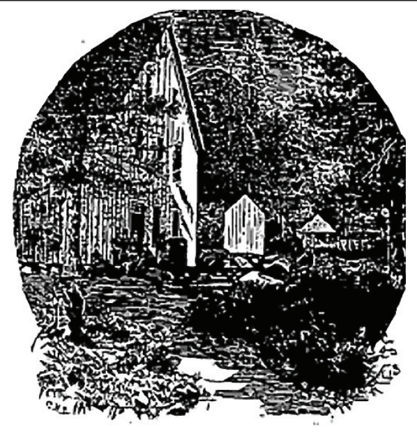
Sodo Springs - The Hotel