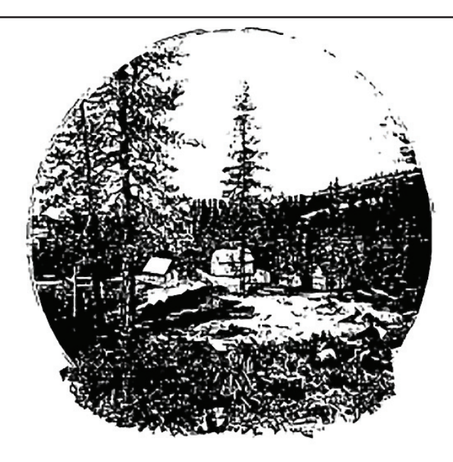
Soda Springs - Ceneral View