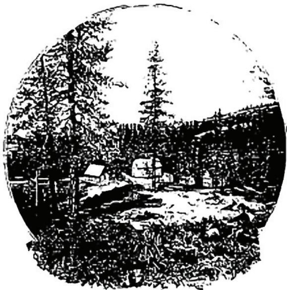
Soda Springs - General View