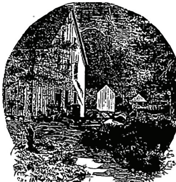
Soda Springs - The Hotel