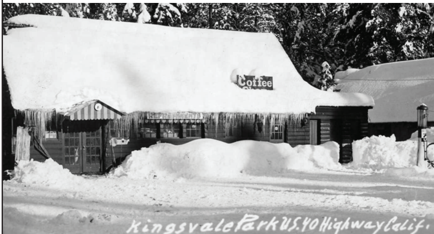
Pictured above: Kingvale Park Coffee Shop, gas and Greyhound bus station.