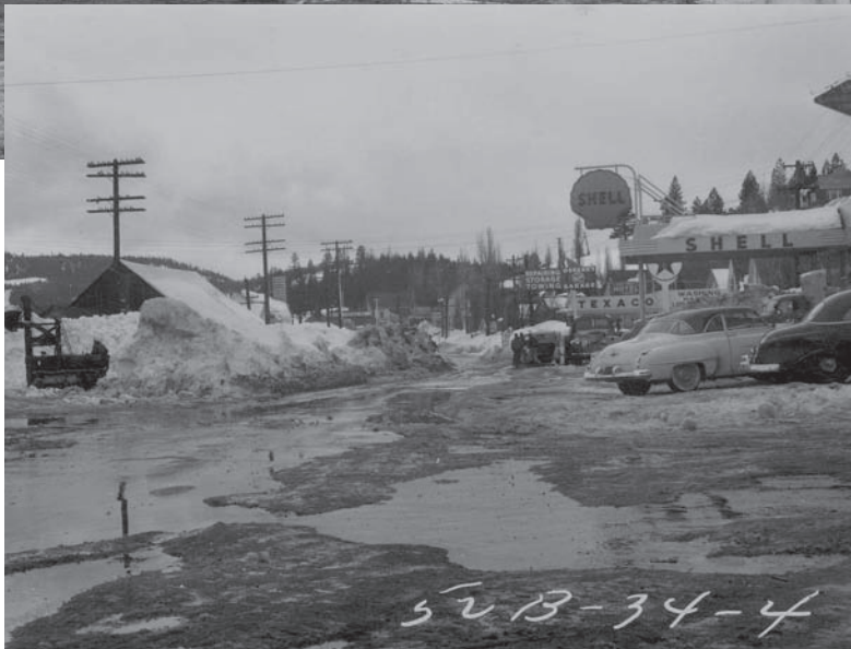
The two pictures here are of Truckee during the winter of 1951-52