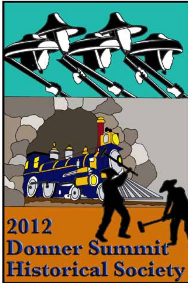
2012 DSHS annual poster on sale at the DSHS

If you would like monthly newsletter announcements, please write your email address below VERY neatly.