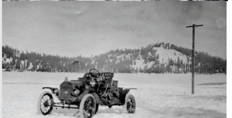
More of Arthur Foote's 1911 trip over Donner Summit. Bottom picture, his Model "T" in Summit Valley with today's Soda Springs Ski Area in the background. Note the tires wrapped in burlap and rope for traction.