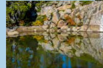
Catfish Pond, possibly stocked with catfish by Chinese RR workers.