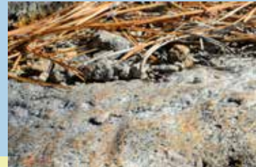
Rust marks and grooves in the granite from emigrant wagons and trains at Big Bend.

20 Mile Museum interpretive signs are all along the route giving the history of the sites, good stories, and things to do.