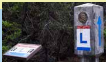
Lincoln Highway marker at Big Bend.