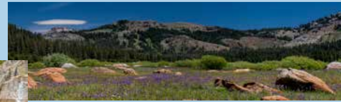
Summit Valley, Jewel of the Sierra.