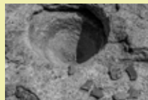
Native American mortars and metates in Summit Valley