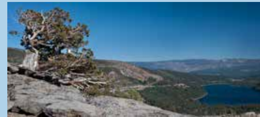
Sierra Junipers, thousands of years old, this one overlooking Donner Lake.