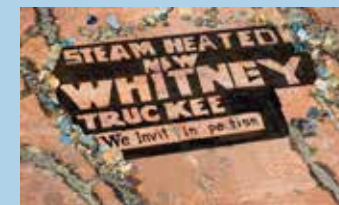
Ads painted on rocks to direct early 20th Century "automobilists."