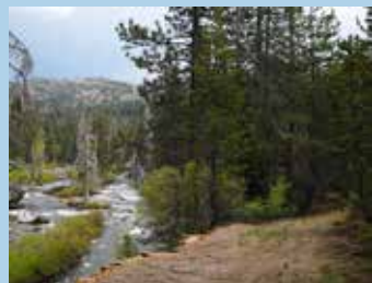
Original Lincoln Highway along the Yuba River.