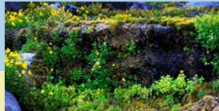
The source of the Yuba River on the flank of Mt. Judah.