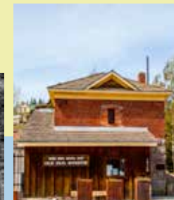
Truckee Donner Historical Society museum at the old jail.