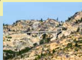
Donner Summit Bridge, 1926