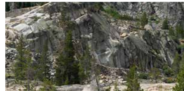
The old Lincoln Hwy on Donner Summit cutting across the face of the granite. You can walk it.

Historic Downtown Truckee is 12 miles from DSHS and 21.5 from Cisco. In Truckee you will find all the conveniences of modern life: fast food, supermarkets, restaurants, and shops. In the historic downtown you will also find the visitors' center in the train station, the