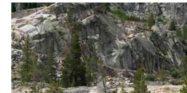
The old Lincoln Hwy on Donner Summit cutting across the face of the granite. You can walk it.

Historic Downtown Truckee is 12 miles from DSHS and 21.5 from Cisco. In Truckee you will find all the conveniences of modern life: fast food, supermarkets, restaurants, and shops. In the historic downtown you will also find the visitors' center in the train station, the