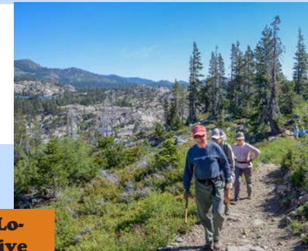
Hikers on the PCT/Judah Loop Trail