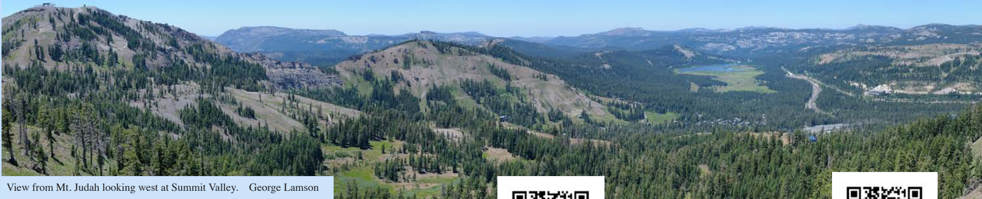
View from Mt. Judah looking west at Summit Valley. George Lamson