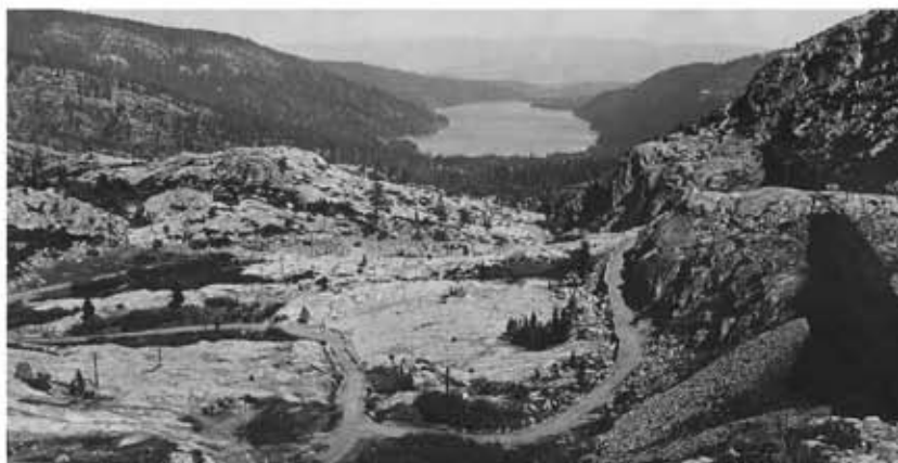
You can see the old unpaved Lincoln Highway in both pictures above.